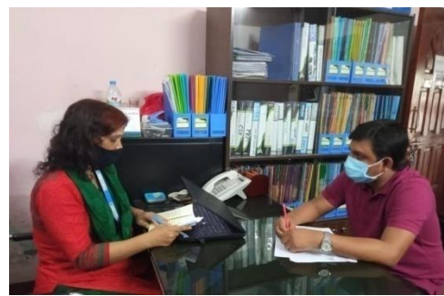
Taking interview at GUK in Gaibandha for External Evaluation for “Strengthening the Role of NGOs and Civil Society Organization (CSOs) for People-centred and Sustainable Development Continuation” supported by ADAB (Association of Development Agencies in Bangladesh) on June 2021.