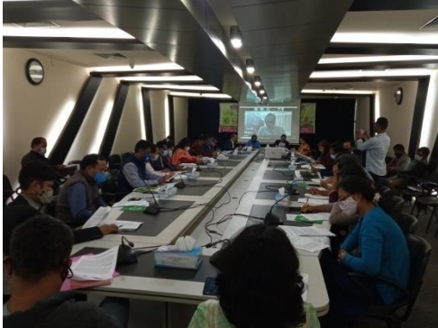
"High Level Policy Dialogue for Indigenous Peoples' Rights: ILO Conventions 107 and 169 for Indigenous and Tribal Peoples in Bangladesh", funded by ILO, 11 January 2022.