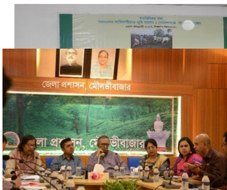
FACTS FINDING TEAM IN A MEETING WITH DISTRICT ADMINISTRATION, MOULAVIBAZAR - LAND RIGHTS VIOLATION BY JULEKHANAGAR TEA GARDEN OWNER AGAINST AN ETHNIC VILLAGE. 21 MARCH 2019