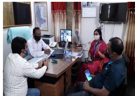
Taking interview Deputy Director of Jamalpur Social Services Department supported by ADAB (Association of Development Agencies in Bangladesh) on June 2021.