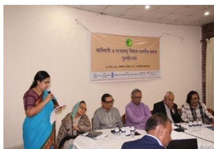
REFORMATION OF IPM CAUCUS 12 MARCH 2019, NATIONAL PARLIAMENT MEMBERS CLUB AUDITORIUM

The IPM Caucus is one of the more appropriate and powerful bodies for influencing the government policy level. RDC involved the IPM Caucus in all its project activities particularly related to ethnic people and other minority groups.