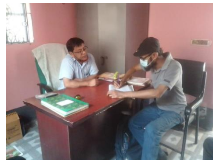
Taking KII for the baseline survey that is supported by Plan International on March 2021.