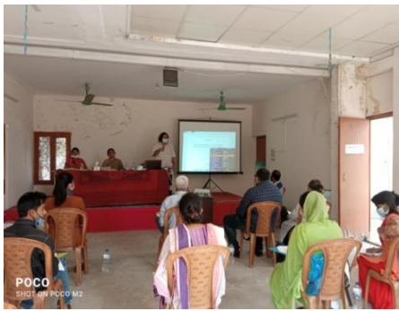
Training session on “Child Bride to Bookworm (Christmas Calendar 2019), Reducing School Dropout in Urban Slums of Bangladesh” supported By Plan International, March 2021.