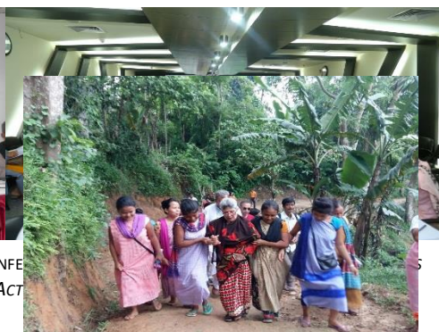
FACTS FINDING TEAM TO INVESTIGATE EVICTION OF KHASIS, BY NAHAR TEA GARDEN'S SRIMONGOL UPAZILA, MOULAVIBAZAR. 22-23 JULY 2018