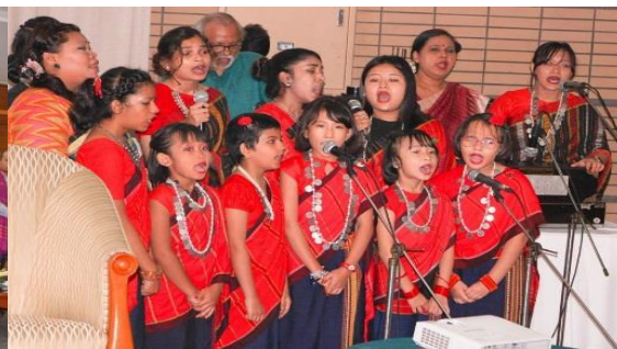
POLICY DIALOGUE ON "RIGHTS OF THE INDIGENOUS PEOPLE: INDIGENOUS LANGUAGES AND LAND" 4 AUGUST 2019, IN OBSERVANCE OF THE INTERNATIONAL DAY OF THE WORLD'S INDIGENOUS PEOPLES 2019.