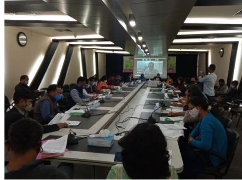
"High Level Policy Dialogue for Indigenous Peoples' Rights: ILO Conventions 107 and 169 for Indigenous and Tribal Peoples in Bangladesh", funded by ILO, 11 January 2022.