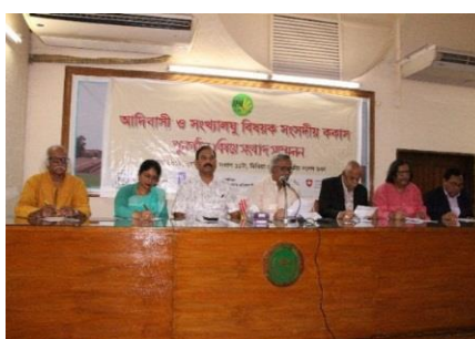
PRESS CONFERENCE 14 MARCH 2019, NATIONAL PARLIAMENT MEDIA CENTRE