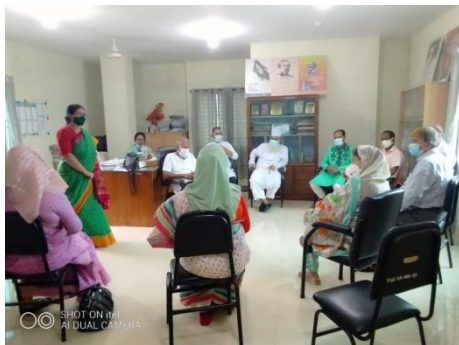
FGI in Comill supported by ADAB (Association of Development Agencies in Bangladesh) on June 2021.