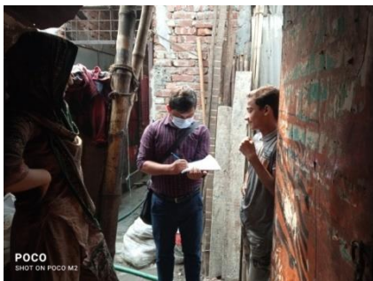
Taking interview for the baseline survey that is supported by Plan International on March 2021.